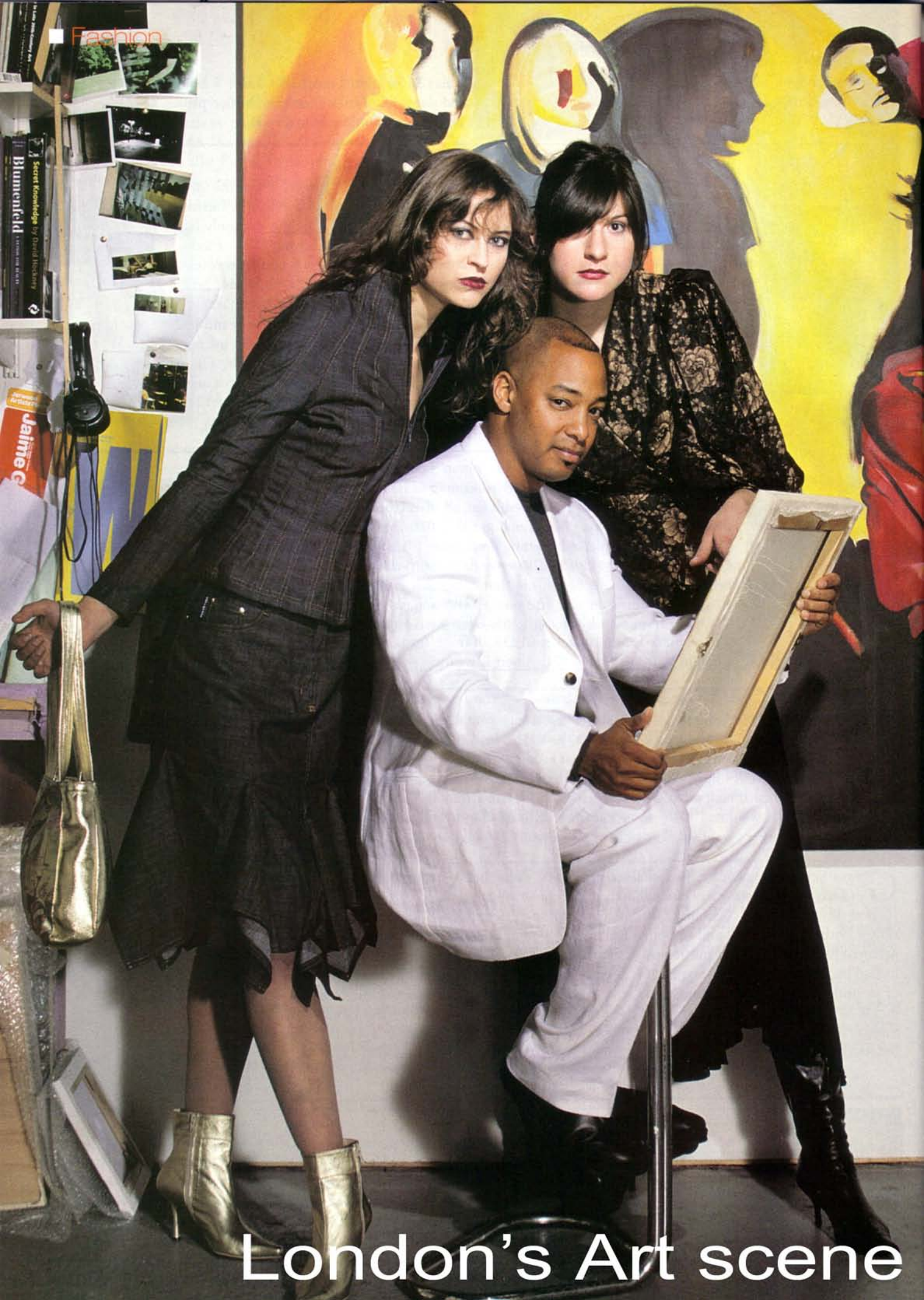
London's Art scene