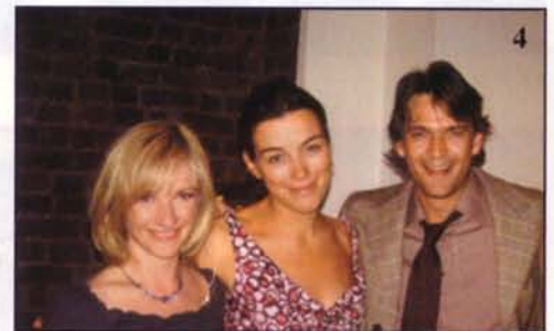
The after show party of premier To Kill a King. 1. Petra Nemcova & David Blaine. 2. Dougray Scott & Jane Horrocks. 3. Dougray Scott & Tara Palmer Tompkinson. 4. Jane Horrocks, Olivia Williams, Dougray Scott, Tara Fitzgerald.