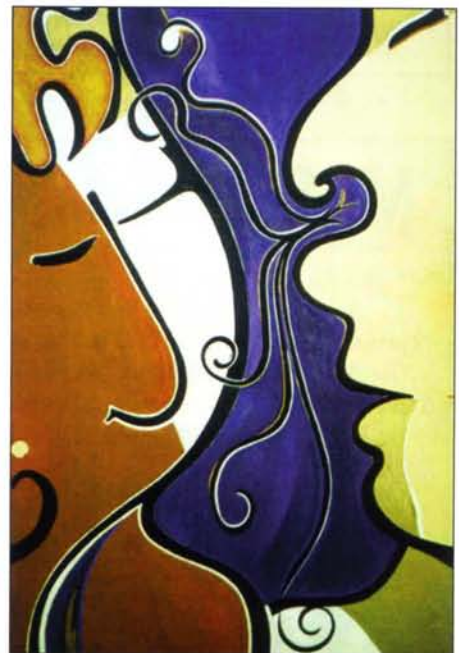
Ambrosia: (24" x 36") above