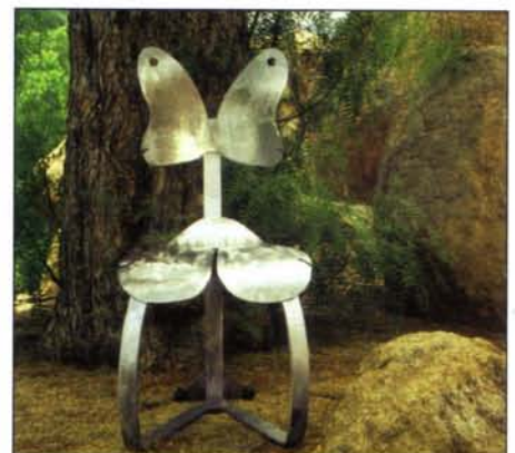
Papillon: (39.5" x 19" x 20")