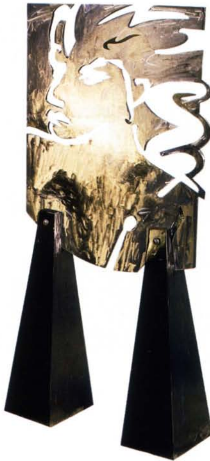
Solitude - Free Standing Sculpture (height 6ft x 3ft wide x 14" thick) above