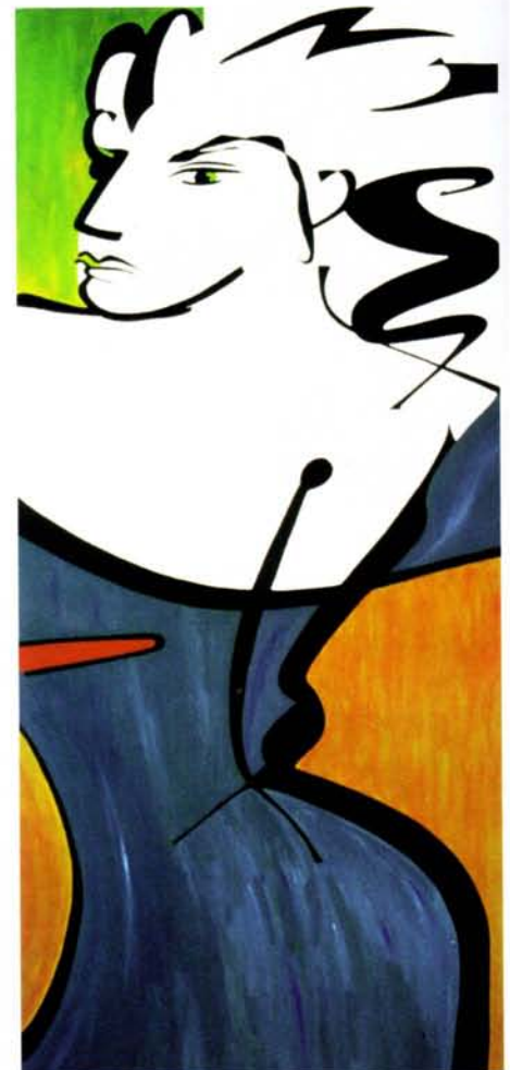
Sonata (8" x 3" x 2")